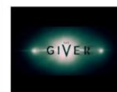
A look at The Giver