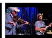
WATCH: Bluegrass band