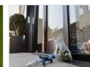
Designer L'Wren Scott committed