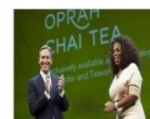
Oprah gives Starbucks tea