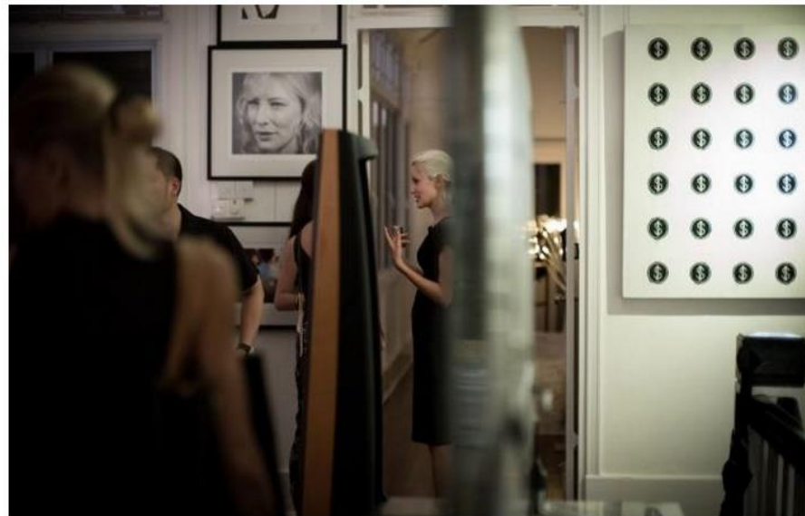
28th Fevrier, Singapore